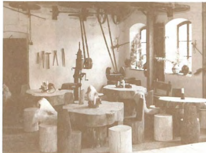
The forge in Bachham — the first Richter production site

1967 — The reaction to the delivery of our first railway