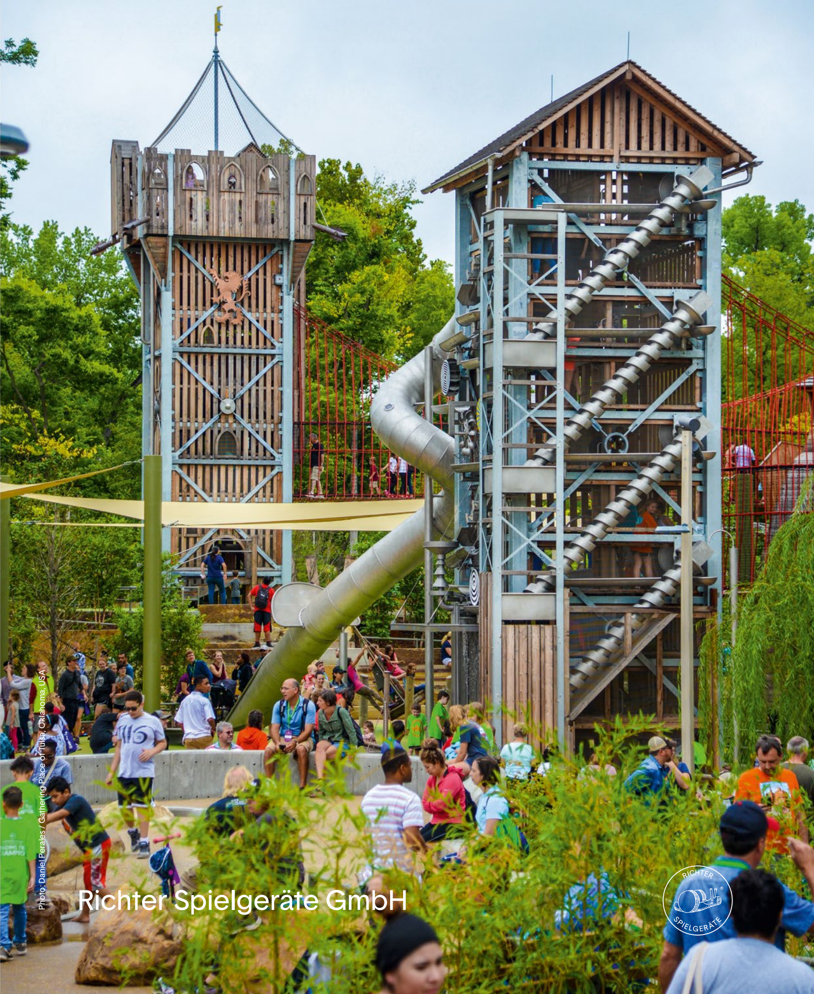
Gathering Place of Tulsa, Oklahoma, USA