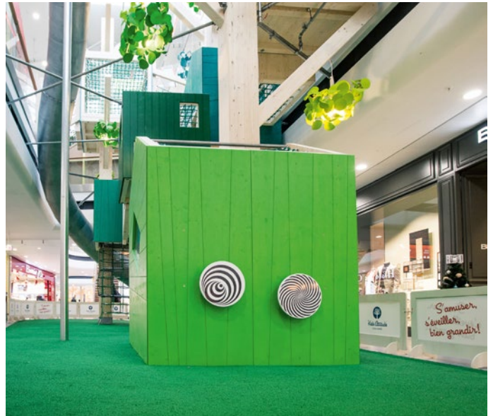
Idea: M. DE DREUZY

The play structure, specially designed for the generous entrance area of the IKEA store in the French town of Bayonne, is a very special attraction.